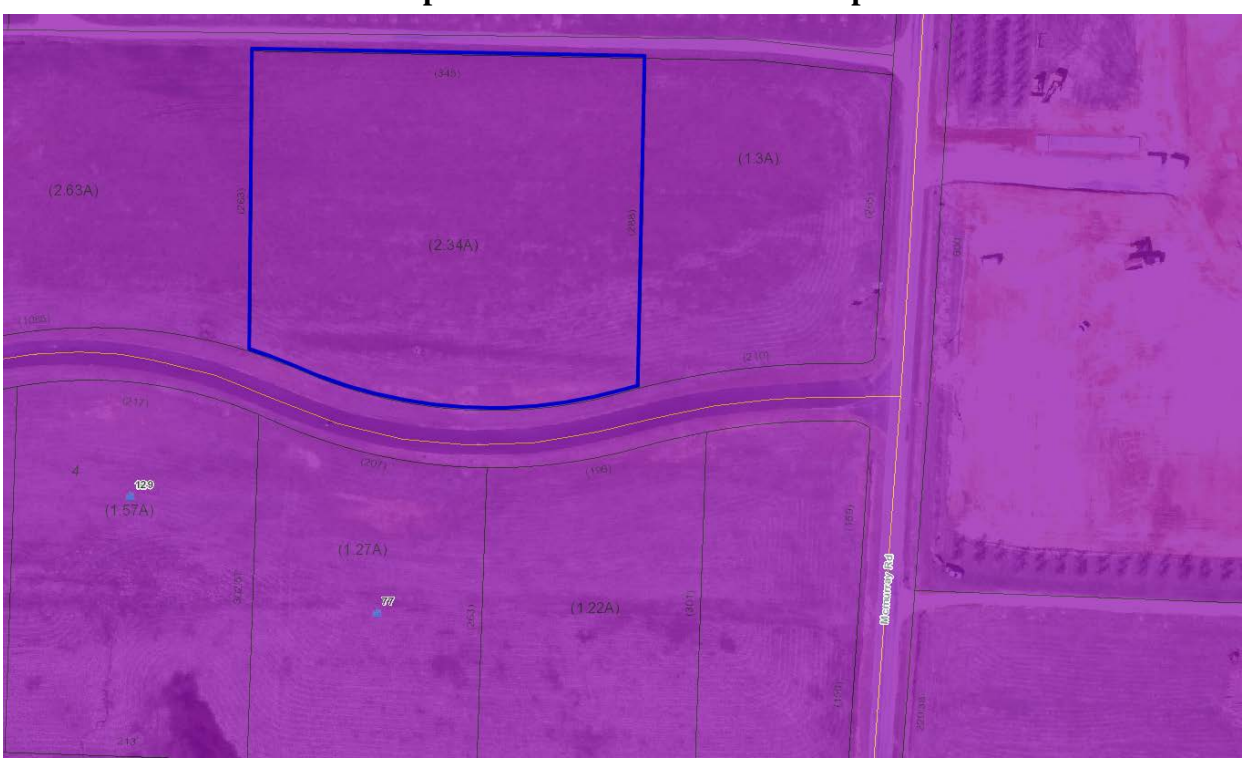
Map C: CCP Future Land Use Map

Public Water: City of Hendersonville Public Sewer: City of Hendersonville